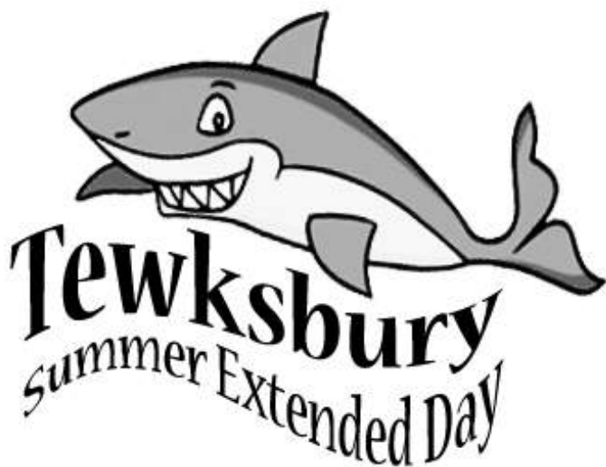
One of our student's shark who helped influence our mascot pick!