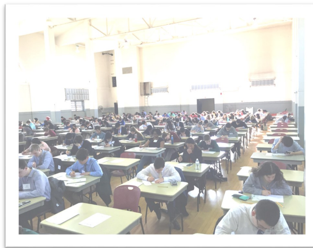
Academic Decathlon Team represented TMHS at Massachusetts Academic Decathlon State Finals held at MIT.

Below are pictures of the students competing in the state finals: