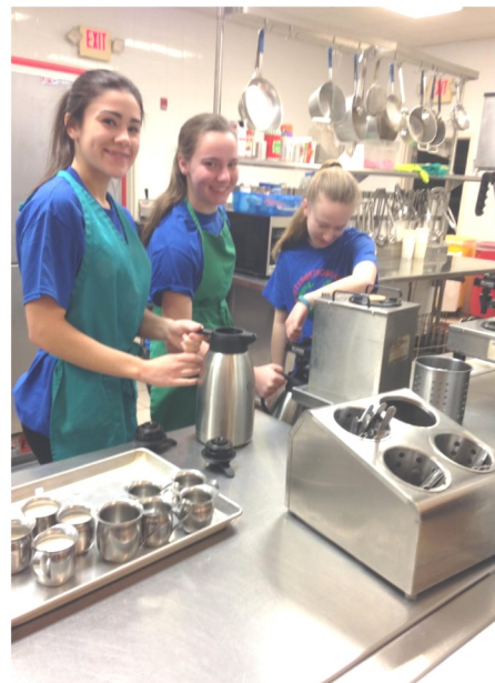
Service with a Smile